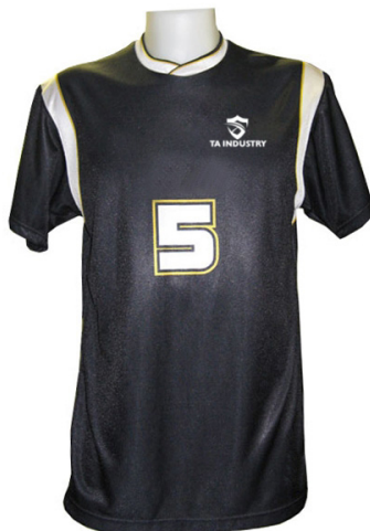
Field Hockey Jersey