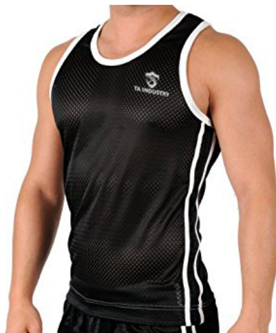
Tank Top For Men

Material: 100% cotton, cotton and polyester , 100%polyester ,Combed Cotton Fabric weight: 140gsm S, M, L, XL