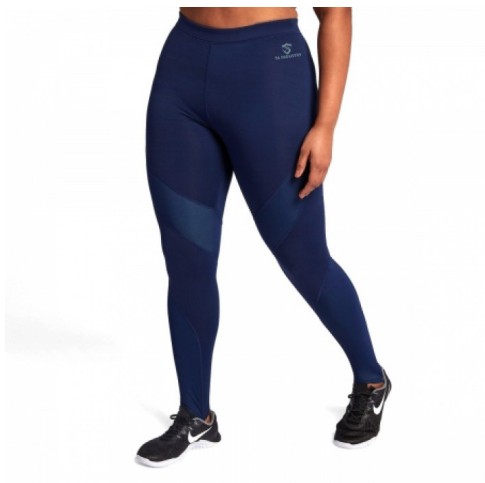
Ladies Fitness Tight

Available in any color as per customer L, M, S, XL