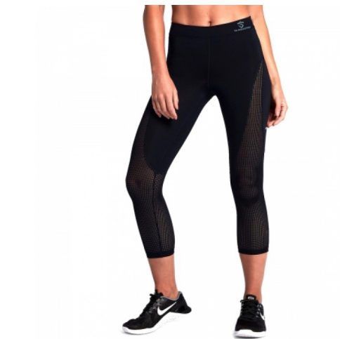
Ladies Fitness Tight

Available in any color as per customer S, M, L, XL