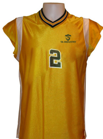
Field Hockey Jersey