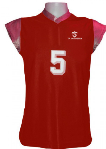
Field Hockey Jersey