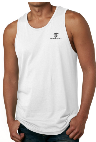
Tank Top For Men

Material: 100% cotton, cotton and polyester , 100%polyester ,Combed Cotton Fabric weight: 140gsm L, M, S, XL