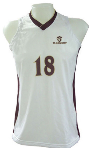
Field Hockey Jersey