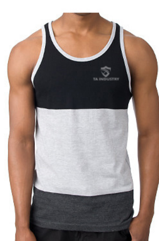
Tank Top For Men

Material: 100% cotton, cotton and polyester , 100%polyester ,Combed Cotton Fabric weight: 140gsm S, M, L, XL