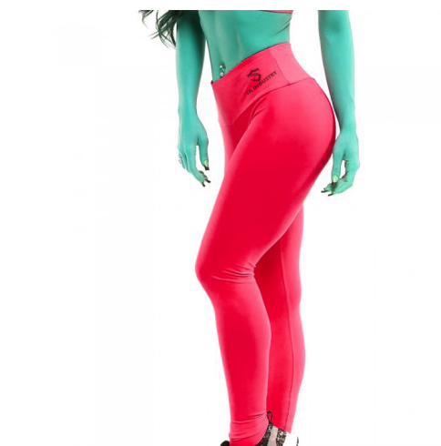
Ladies Fitness Tight

Available in any color as per customer S, M, L, XL