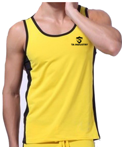
Tank Top For Men