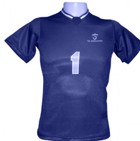
Field Hockey Jersey