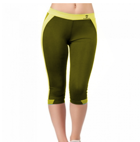
Ladies Fitness Tight

Available in any color as per customer S, M, L, XL