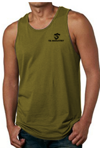
Tank Top For Men

Material: 100% cotton, cotton and polyester , 100%polyester ,Combed Cotton Fabric weight: 140gsm S, M, L, XL