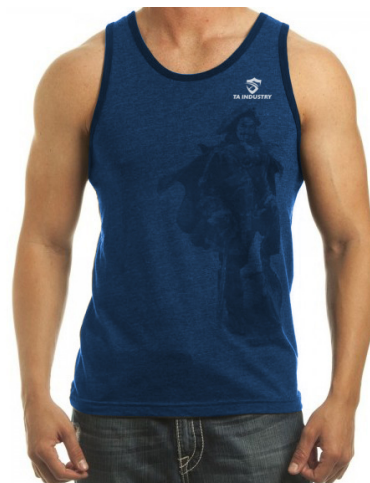
Tank Top For Men

Material: 100% cotton, cotton and polyester , 100%polyester ,Combed Cotton Fabric weight: 140gsm S, M, L, XL