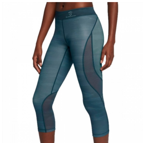
Ladies Fitness Tight