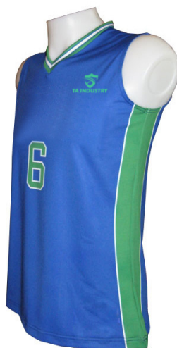
Field Hockey Jersey